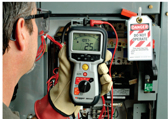
Panelboard testing is faster, easier and safer with the new MIT400 Series.